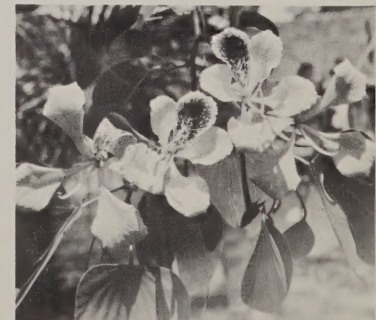
FLORIDA ORCHID TREE

The Bauhinia is called "Poor Man's Orchid" or Florida Orchid because it thrives well and blooms heavily. Easy to grow, it is one of the most attractive flowering trees for Florida! Plant one each of the purple and white flowering beauties and enjoy them each winter and spring when they bloom!